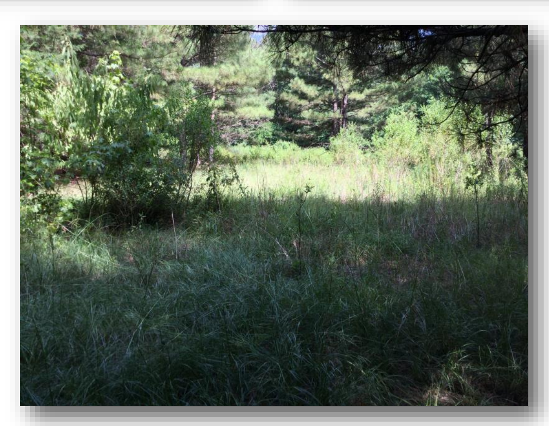
4 Corner Properties, LLC 577 HWY 51, Ste. A Ridgeland, MS 39157 www.4cornerprop..com